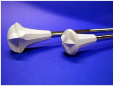
Fluted Super Star 3/8 in.

The SUPER STAR baton is the world's most popular baton. It has been used by State, Regional, and World Champions for years.