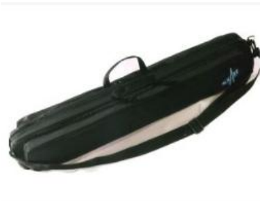
Deluxe Professional Case

This is our most impressive case. This case is manufactured of abrasive resistant duracord, durable and attractive with handles and shoulder strap.