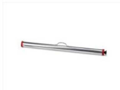
Fire Baton Case 29 and 33 Inch

Another piece of fire twirling equipment that is helpful is a metal carrying case.