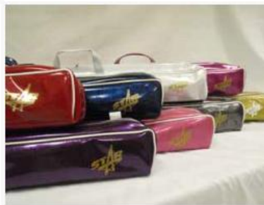
Sparkle Case Large and Small

This case holds up to eight batons 30 inches long. Has hooks for straps. It is available in a variety of sparkle colors.