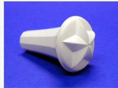
Super Star Tip

The SUPER STAR TIP is uniquely designed and engineered ONLY for the Super Star baton.