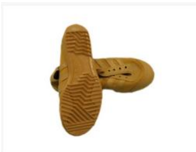
InStep Shoes - Tan

For: Twirlers, Cheerleaders, Dance Teams, Majorettes, Drill Instructors, Flag Corps.